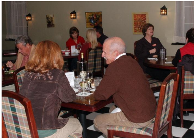
Above: Guests enjoying a meal in the cafe